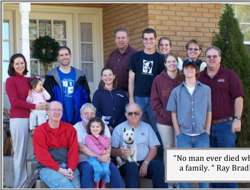
"No man ever died who had a family." Ray Bradbury