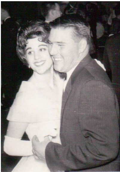
New Year's Eve Dance 1960