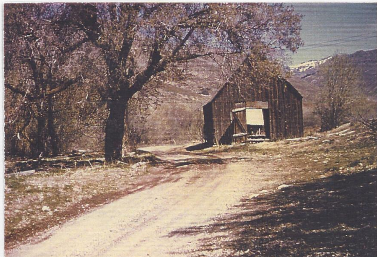
Built by Hyrum